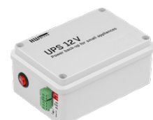
Back-Up UPS 12V

Double converter for Pt-100 and Pt-1000 probes