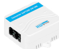
Converter 2xPt100 1W-UNI

Double converter for Pt-100 and Pt-1000 probes