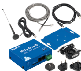
Ares 10 set

Bulk + temperature sensor, power adapter, GSM antenna, USB cable and CD with software