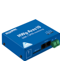
Ares 10 plain