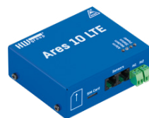
Ares 10 LTE

Temperature sensor, power adapter, GSM/LTE antenna and USB cable