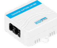
Converter 2xPt100 1W-UNI

Expands one 1-Wire UNI to four digital inputs