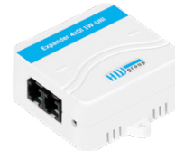
Expander 4xDI 1W-UNI

Expands one 1-Wire UNI to four digital inputs