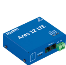
Ares 12 LTE plain

14x 1-Wire UNI, 2x DI, device with battery only