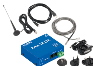
Ares 12 LTE set

14x 1-Wire UNI, 2x DI, device with battery only