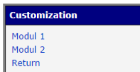
Figure 1: Menu of the Band Select user module – in case of Bivias router

The web interface available for configuration of the Band Select user module can be invoked by pressing the module name on the User modules page of the router's web interface. The left part of the web interface (i.e. menu) contains only the Return item, to switch back to the router's web interface. In case of Bivias routers, there are Modul 1 and Modul 2 items available to manage both GSM modules of Bivias router separately.